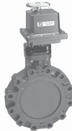
Declutchable Style Shown

Spears® innovative patented seat design departs from traditional liner-seat type valves to eliminate seat creep, reduce operating torque and provide positive seal off. Ideally suited for flow control or throttling, this high performance valve offers a full variety of options for greater application versatility. Fully isolated (Dry Stem), solid type 316 stainless steel with optional PTFE coated stems available for extra protection assurance. PVC and CPVC valves are available in Standard or True Lug style for sizes 1-1/2" through 14". Polypropylene valves are available in Standard valve style for sizes 1-1/2" through 24", plus sizes 30" through 60" produced to order. Premium electric actuator utilizes a reversing type motor with UL approved, built in thermal overload protection. Gear train is permanently lubricated with manual override standard. Enclosure is corrosion resistant polyester powder coated aluminum, weatherproof NEMA 4 rating, 1/2" NPT conduit outlet. Includes 2-SPDT limit switches pre-wired for standard 115 VAC connection.