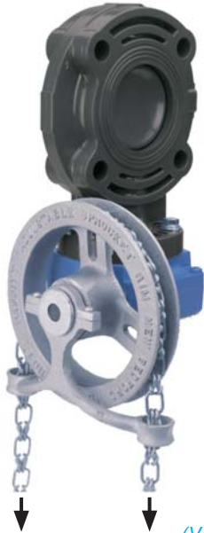
(VALVE NOT INCLUDED)