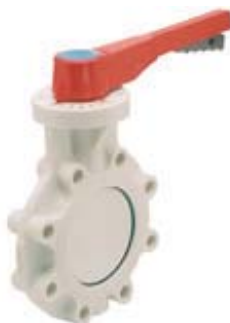
Lever Handle Style

Pressure Rating @ 73°F (23°C), Water 1-1/2" - 12" 150 psi Maximum Service Temperature PP = 180°F (82°C)