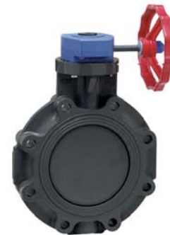
Gear Operator Style

Pressure Rating @ 73°F (23°C), Water 1-1/2" - 12" 150 psi Maximum Service Temperature PVC = 140°F (60°C) CPVC = 200°F (93°C) Temperature/Pressure De-ratings Apply See Butterfly Valve Accessories & Repair Kits Section for Additional Options and Features