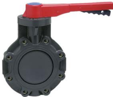
Lever Handle Style

Pressure Rating @ 73°F (23°C), Water 1-1/2" - 12" 150 psi Maximum Service Temperature PVC = 140°F (60°C) CPVC = 200°F (93°C) Temperature/Pressure De-ratings Apply See Butterfly Valve Accessories & Repair Kits Section for Additional Options and Features