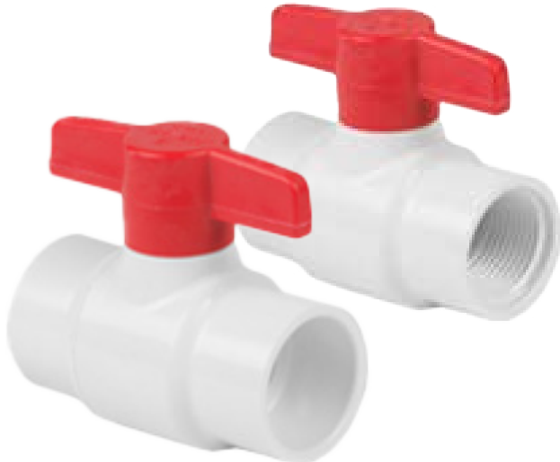
Spears® Cold Water Ball Valves

A Combination of Economy & Quality - Made in the U.S.A. for Greater Value in a General Purpose Cold Water Valve